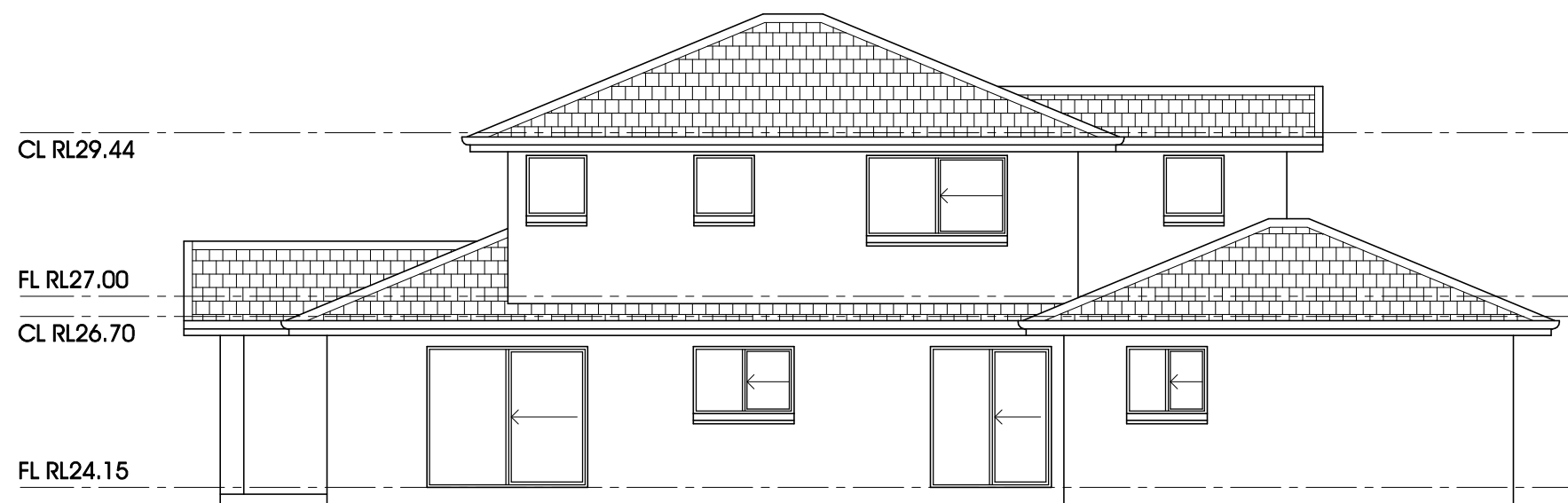
north west elevation