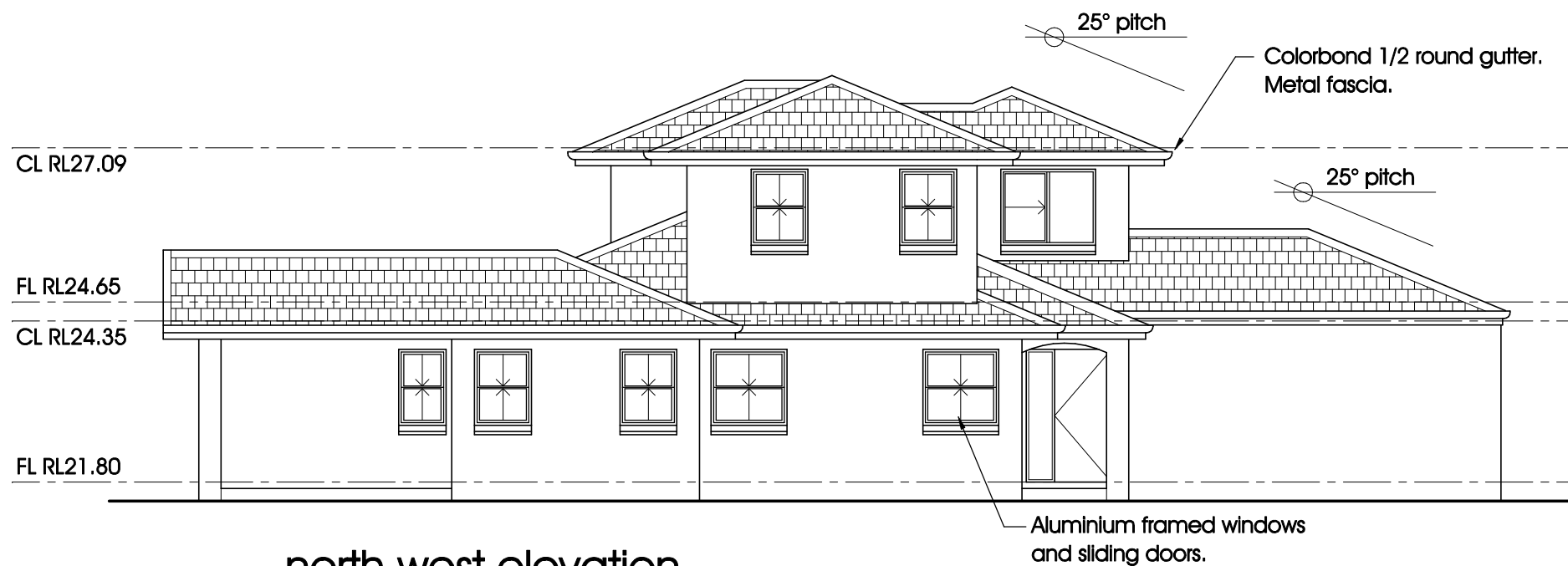
north west elevation