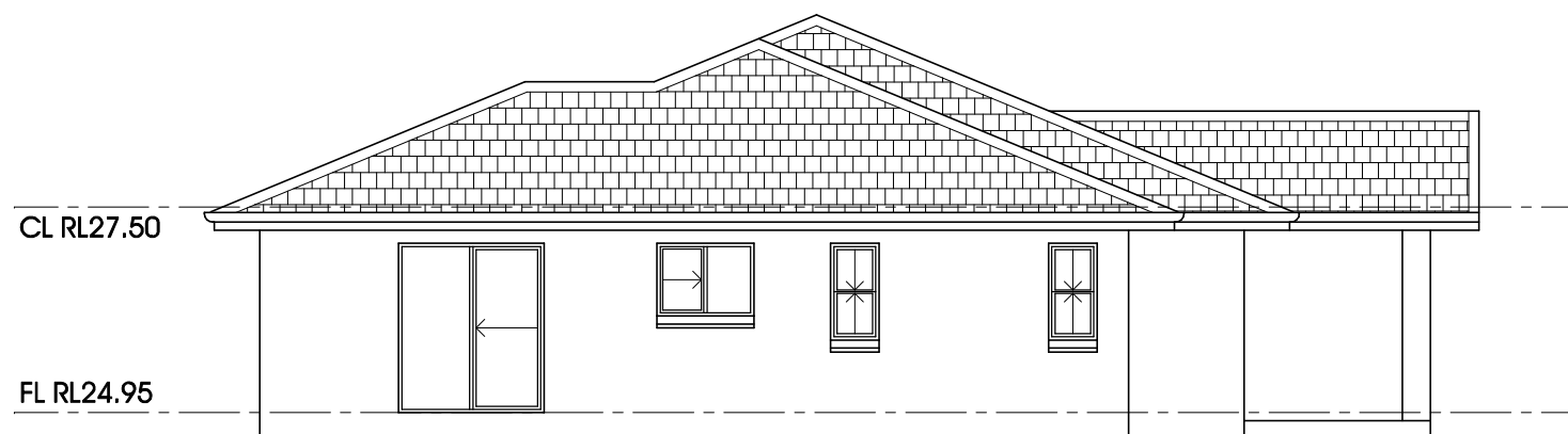
south east elevation