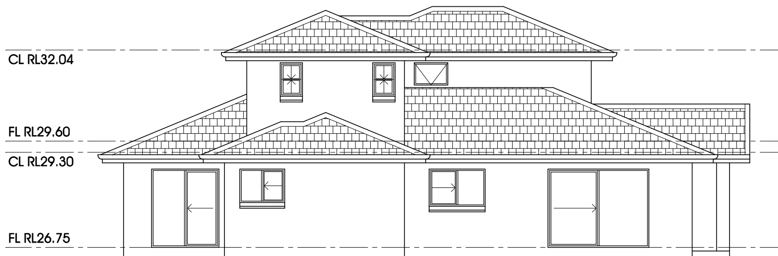
south east elevation