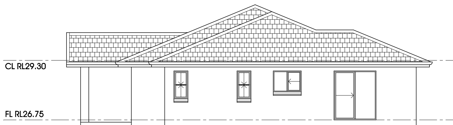
south west elevation