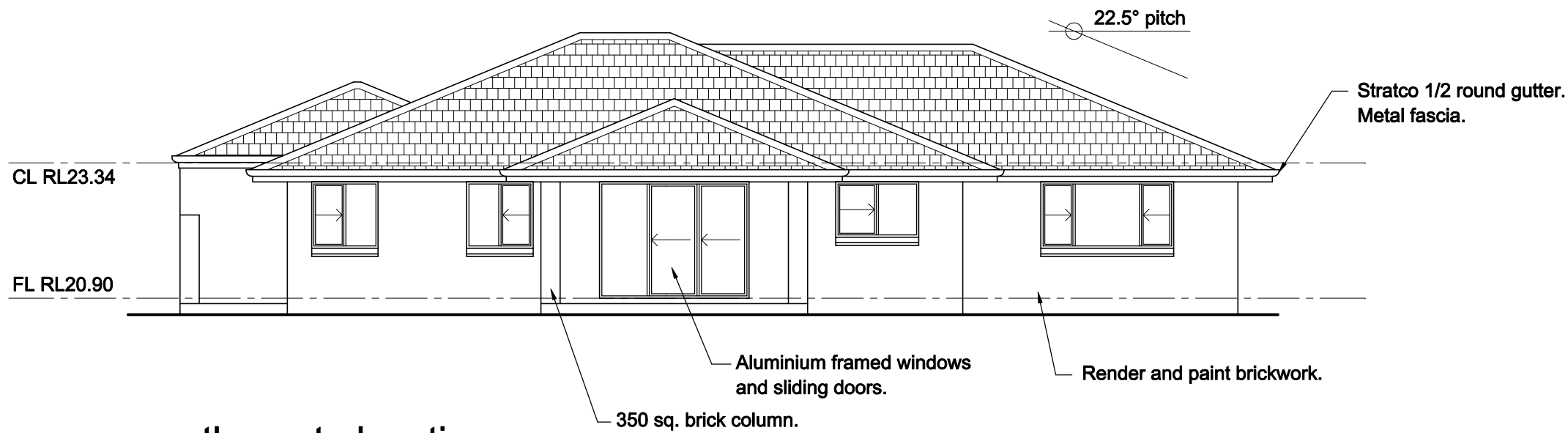
north west elevation